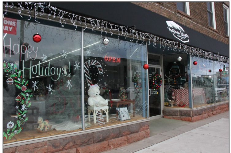
901 Cloquet Avenue.

loan repayments were identified to be directed to commercial projects, consistent with past City practice, and are being granted to commercial buildings within the original grant’s adopted downtown blight area.