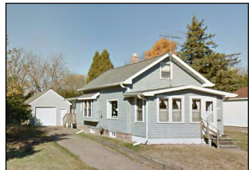
Photo of 1417 Avenue C

GCL Development Group LLC recently purchased the home at 1417 Avenue C to expand their property. The home is in good shape and has the potential to be relocated. As such, GCL Development Group LLC contacted the City to inquire about tax forfeit lot opportunities on which they could examine relocating this home or constructing a new spec home. City staff conducted that review and directed them to a few empty lots, one of which was a County tax forfeit lot. After reviewing those options, GCL Development Group LLC responded stating they had interest in working with the City to obtain this tax forfeit lot for a housing project, please find that letter attached.